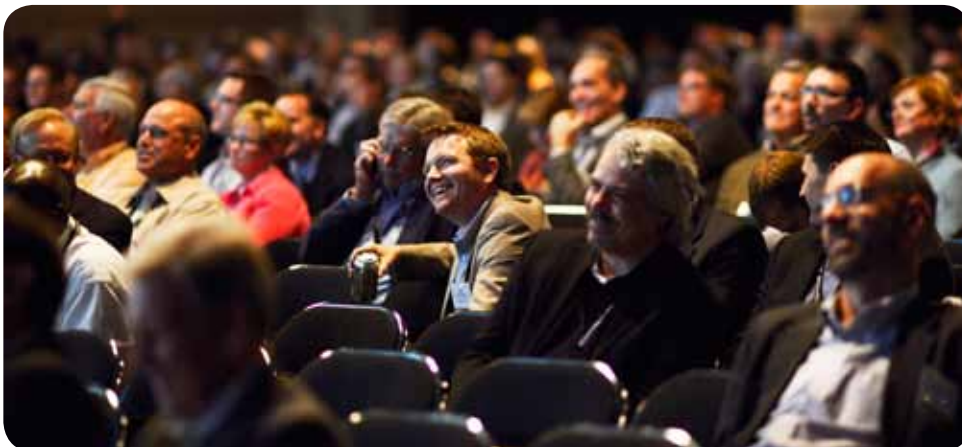
Printing courtesy of Wagenbrenner Development